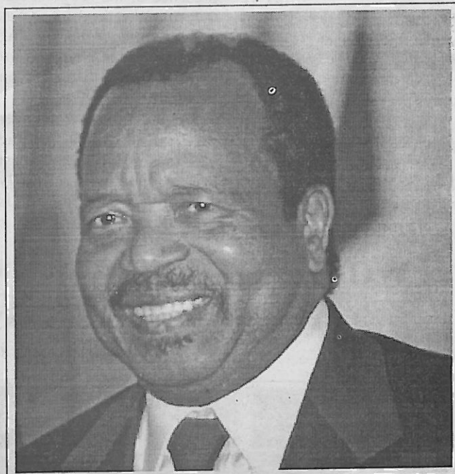
The President was almost left francless in the US

And a prompt investigation by the security soon revealed that the vehicle was about to be used by the lieutenant who was planning to escape with the